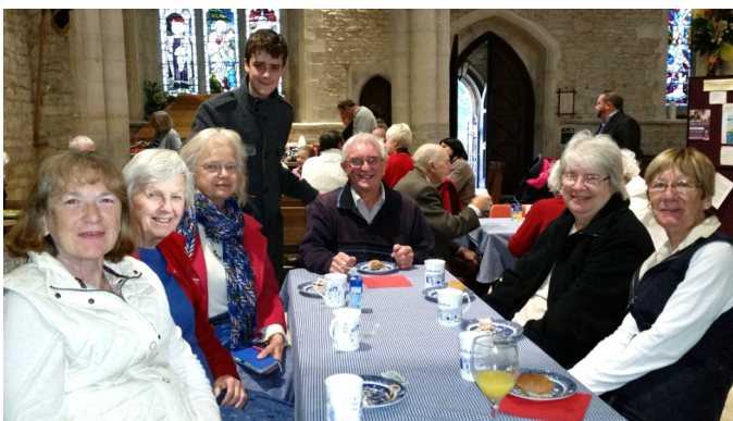
Emberton ringers enjoying Bacon & Sausage Butties before ringing for Harvest Festival.