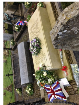
Photo of the family plot and Churchill's grave, located to the north of the tower at St Martin, Bladon, Oxon.