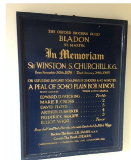
The OGD peal board recording the peal rung by Guild officers immediately after his interment.