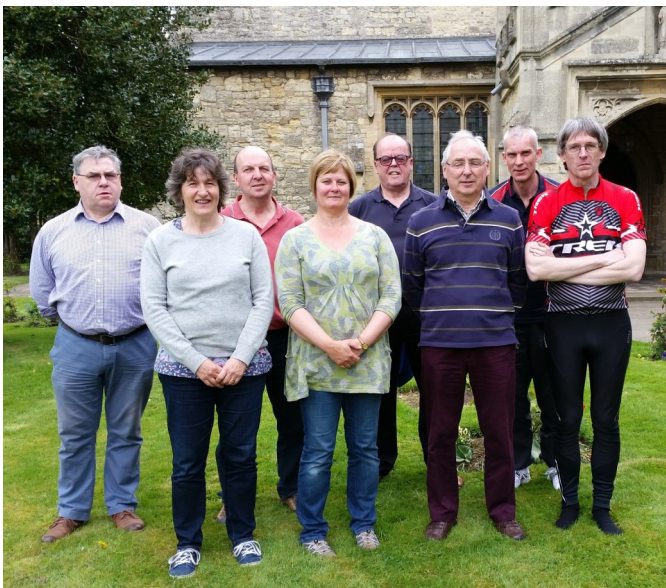
The North Bucks Team who came 2nd

EBSB rang first with a peal speed of 3:08. A very enjoyable and competent piece of ringing attracting 68 faults Next were Tilehurst. Peal speed 3:10, backstroke leads caused some issues but the ringing was improving all the time. 67 faults North Bucks rang third, peal speed 3:10. Very good ringing with trips coming in clusters then settling again. 63 faults.