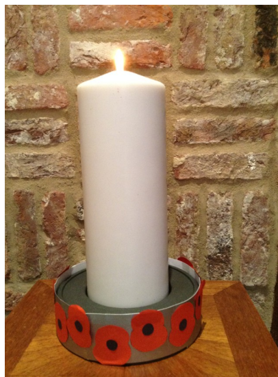
The Memorial Candle