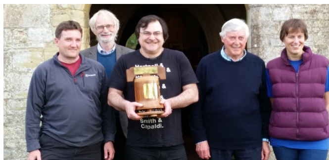
The winning team