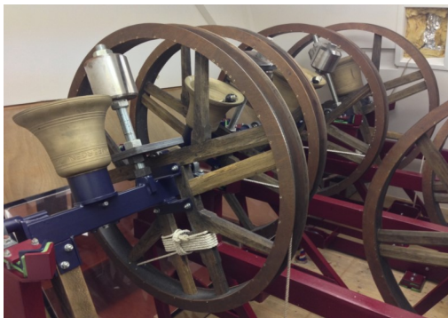
Picture of the bells