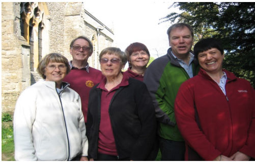
Milton Keynes Village