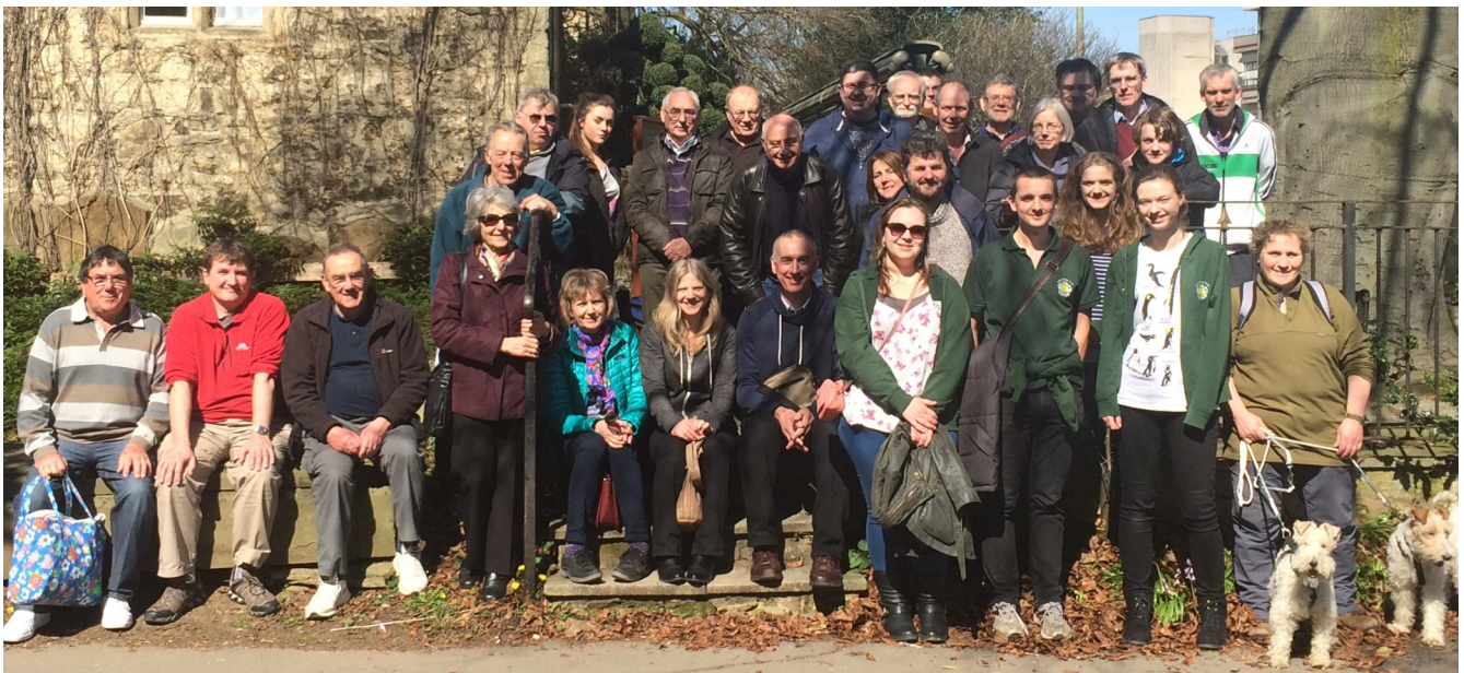
outside St. Giles.