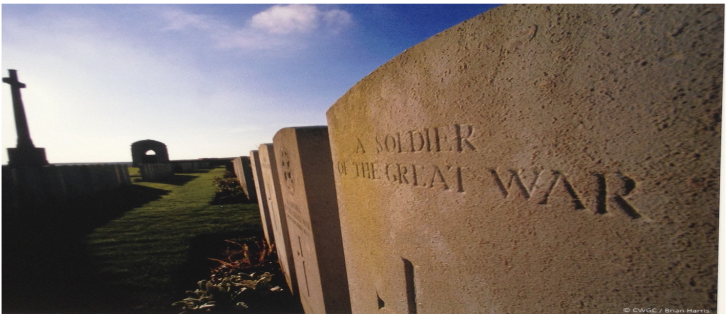
Rudyard Kipling chose the inscription – "A Soldier of the Great War. Known Unto God" – for the headstones of those who could not be identified. There are more than 50,000 unidentified burials on the Somme. « Un Soldat de la Grande Guerre. Connu de Dieu Seule », cette inscription fut choisie par Rudyard Kipling pour les pierres tombales de ceux qui n'ont pu être identifiés. Il y a plus de 50 000 sépultures non identifiées dans la Somme.

His service began on the 4th November and he was initially stationed at Sheffield. He joined the BEF on the 26th January 1916 and died from Tuberculosis 267 days later. He was buried in the Longuenesse (St Omer) Souvenir Cemetery in plot IV.A.66.